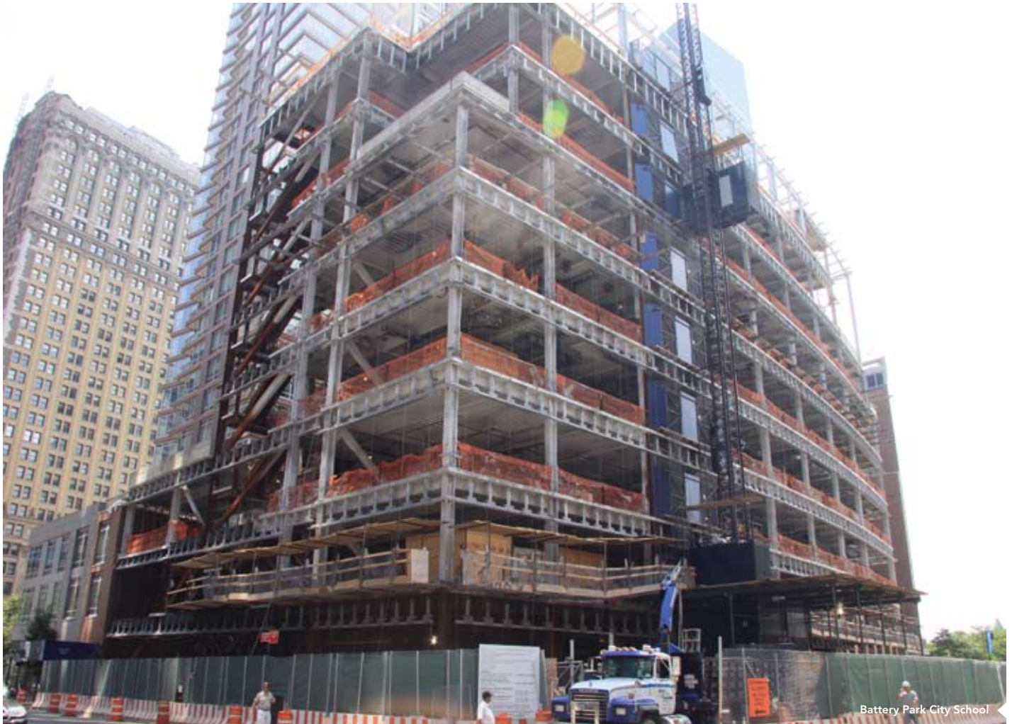
Battery Park City School

More than 90 years of hard work gives general contractor great range