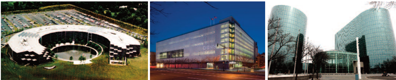
(Left to right) Top: The Crescent at Bridgewater, New Manhattan Community Districts 1/2/5 Garage, RXR (EAB) Plaza Middle: Ruppert-Yorkville-Knickerbocker Towers, Museum Tower, 100 UN Plaza, South Beach Psychiatric Bottom: U.S. Mission to the UN, Confucius Plaza, Azure and Brooklyn Botanical Garden